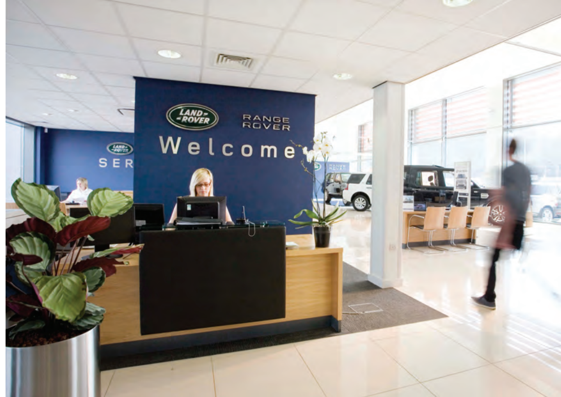
New Land Rover showroom for Caffyns. Extensive external works were required including the provision of new incoming services and drainage.

Synergy's expertise in the automotive sector is extensive. We have an outstanding track record in this sector and regularly work with clients on complete showroom re-branding, new build showrooms and their ancillary buildings. We have worked with many of the leading franchise retailer groups over a wide range of brands. We ensure that each of our client's individual requirements are tailored for and that no detail is overlooked. We have a dedicated car dealership team, who continually research any new developments in this fast moving sector. Our team is focused on offering our clients an exceptional service; providing value driven solutions that not only deliver a superior finish, but deliver on time.