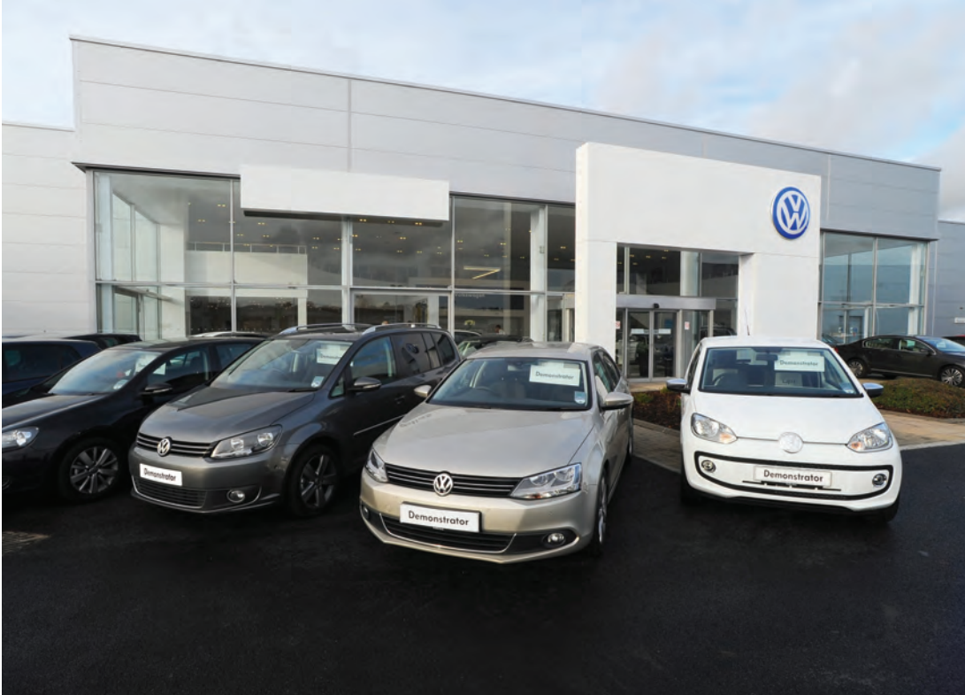
Rebrand of Volkswagen automotive showroom, part of a roll out of franchises for Caffyns across the South East.