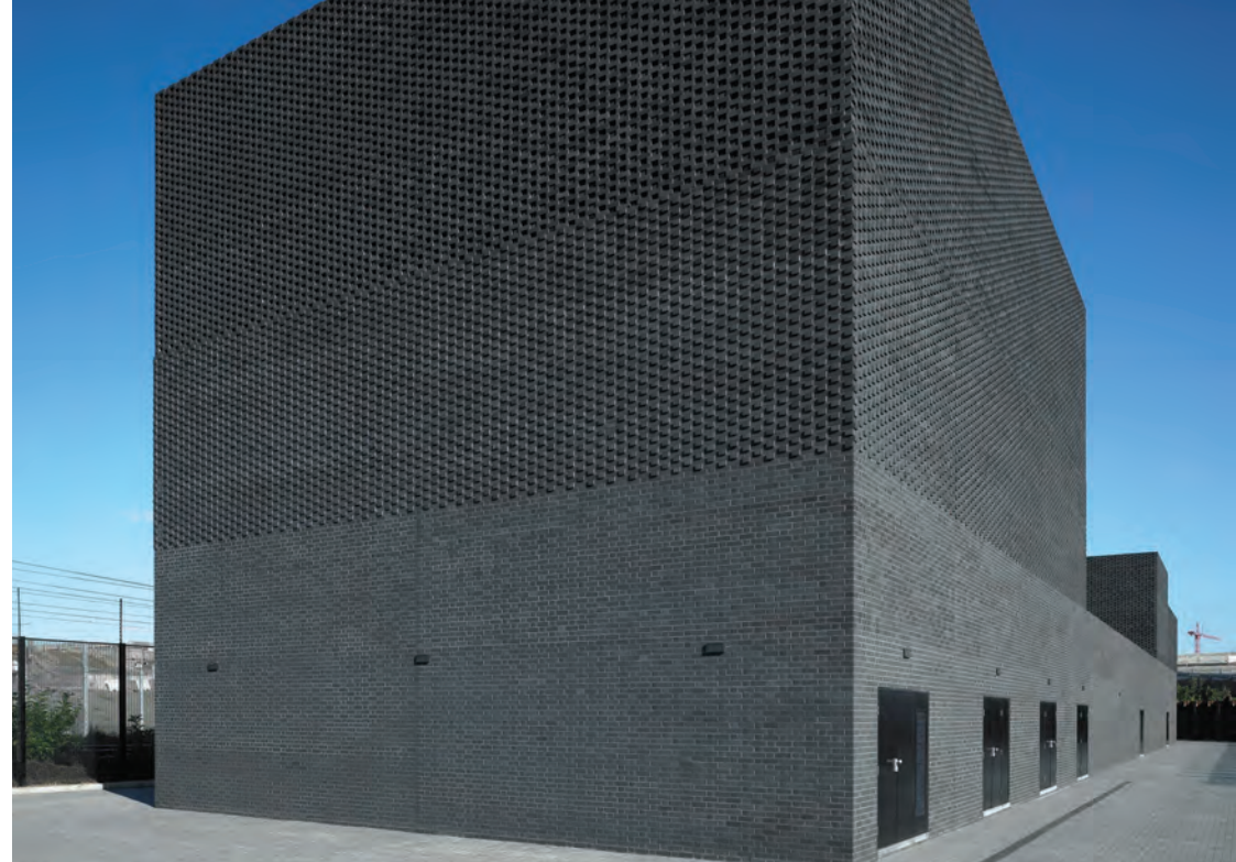
Kings Yard Primary Substation. At the Queen Elizabeth Olympic Park, London (won the Brick Awards - 2010).

For UK Power Networks we provide a full range of services from CDMC, Logistics, Health and Safety, Project Management of the Civil Engineering and building elements, Project Planning, Quantity Surveying and most recently Commercial Management. All of which are supplementary to the core of the project which is the Engineering