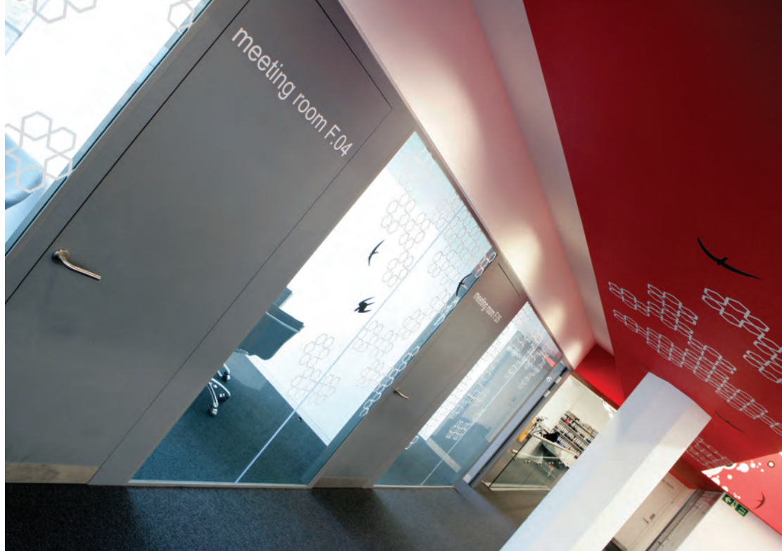
EMAP Offices. New partitioning was installed including glazed screens to create new meeting rooms.