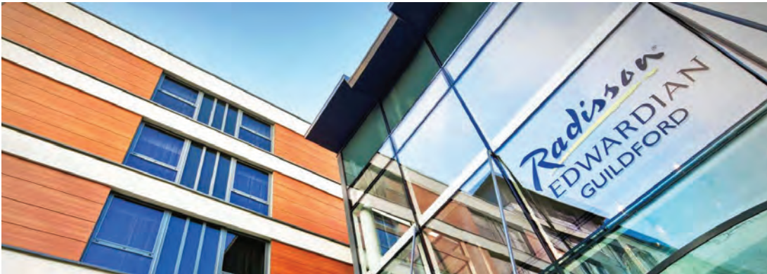
Guildford Hotel. Incorporated within the overall design are 38 luxury apartments all to a superior specification, including two roof-top penthouses with terraces.