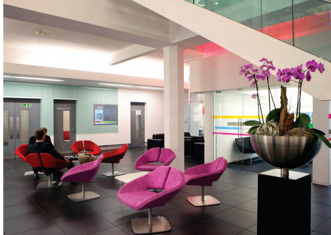
EMAP Offices. Refurbishment and alteration of existing offices at lower ground, ground and first floors, including a new glass staircase leading to a new central cafeteria at first floor.

In this competitive market our teams appreciate the need for economic solutions that both meet the client's brief and look to provide an enhanced customer experience. We have a wealth of knowledge in this sector and understand the pressures these projects can face, and proactively look for solutions to even the most challenging project limitations.