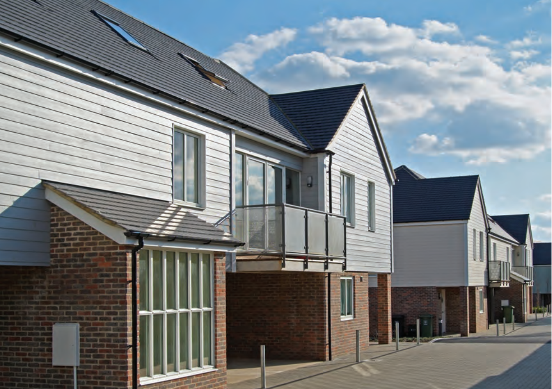
Hightown Praetorian and Churches Housing Association. New affordable housing in Hemel Hempstead featuring low carbon technology, constructed in sustainable locations in the built up area.

We are experienced in low carbon technology and off-site construction, and have experience in general and special needs projects.