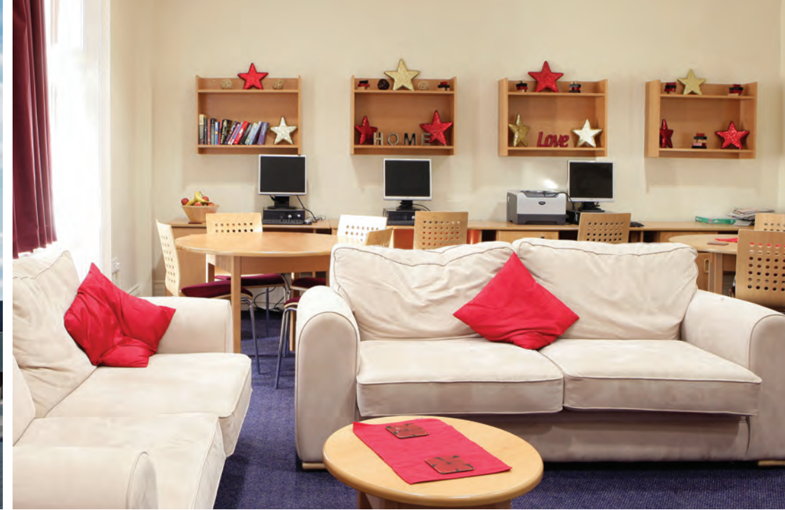
Bournemouth Collegiate School. Alterations and refurbishment to the second floor of the main school building to create en-suite student accommodation.

We look to work with our clients to provide comfortable homes that both compliment and sustain the local community. We critically appraise all processes and components suggested for a project to determine whether better value alternatives or solutions are available. We proactively look to deliver lean construction through efficiencies which enhance both cost and delivery.