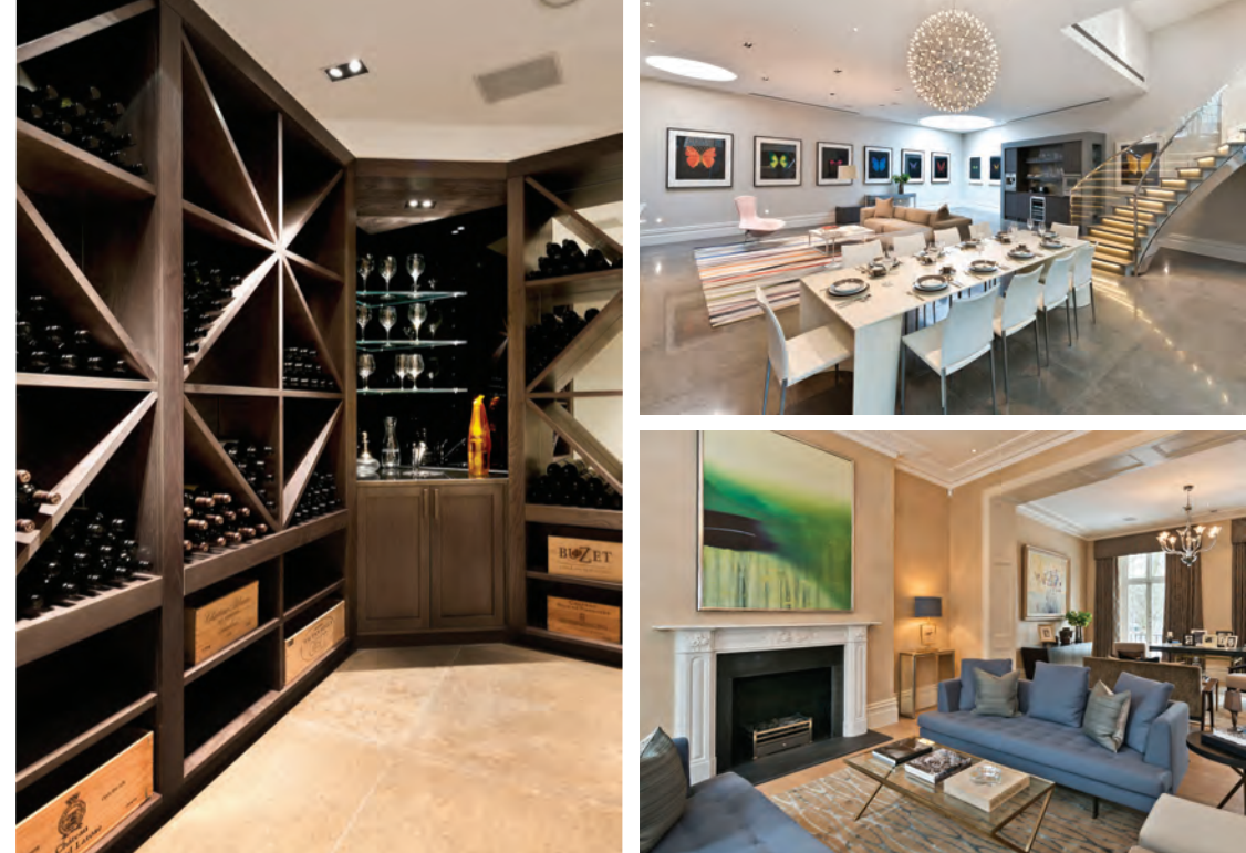
Private Sector. We advise on sourcing high quality finishing materials, fittings and designers and the associated costs.