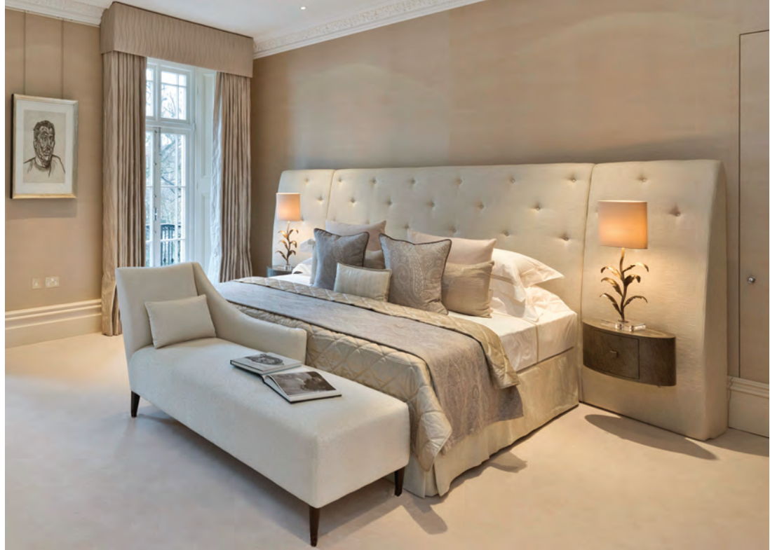
Private Sector. We work on projects ranging from small extensions to much larger new buildings.