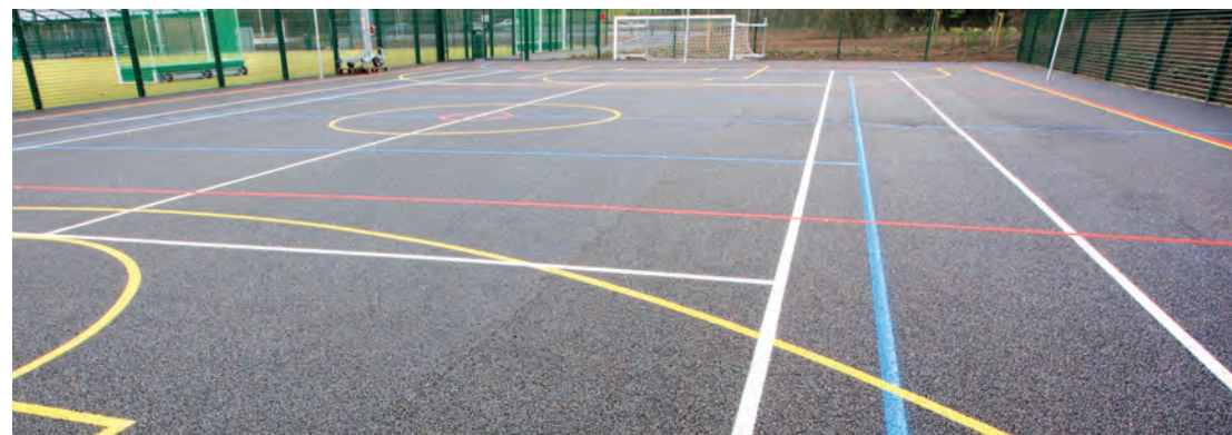
Surbiton High School. New sports pitches including all weather hockey pitch, multi-use games area and tennis courts.