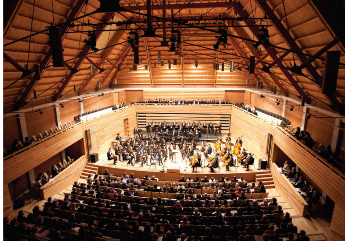
Sevenoaks School. Construction of the performing arts centre including three performing art spaces with auditorium, a drama studio, a recital hall and music teaching and practice rooms.

Synergy are proud to have worked on numerous prestigious projects including the masterplan for the future development of Lord's Cricket Ground in London and more recently for Sussex County Cricket Club on the redevelopment of the County Ground at Hove. Synergy understand the significance that sports facilities can have on empowering individuals and local communities and are completely focused on helping to provide inspiring projects that deliver long-term sustainable solutions.