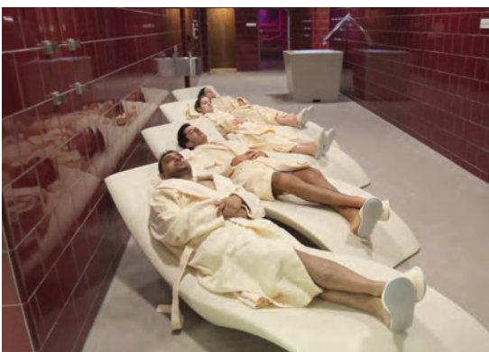
Ironmonger Row Baths. £16.5 m project for Islington Council and EC1 New Deal for Communities, involving extensive refurbishment of the existing baths to modernise and improve accessibility for the local community.